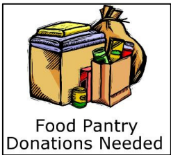
Food Pantry Donations Needed

Are you allowing the Lord Jesus Christ to create in you a new, giving heart? Or are you still following the Toddler's Creed?